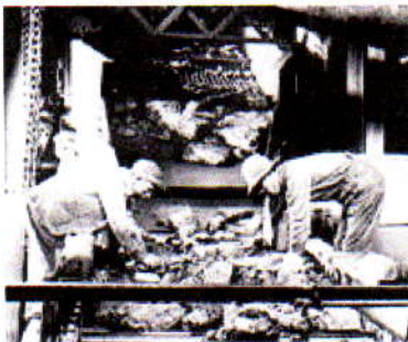
Miners in Dawson sort through coal at the "lump-picking table" in May 1921.

Editor's note: This Sunday, hundreds of former Dawsonites and their descendants will converge on the site of the former coal-mining town between Raton and Cimarron. The bi-annual Dawson Reunion has been held since 1954. The following is excerpts from a longer article that was researched and written by the grandson of a Dawson miner who came from Italy to America in 1895 and arrived in Dawson in 1911. The author has attended the Dawson Reunions since 1988 and plans to be there again this year.